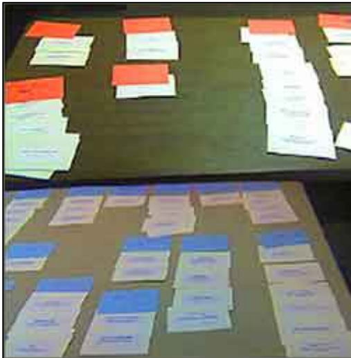
Figure 2: Card Sorting

When an information architect and research design practitioner wants to find out more about the needs of end users, it is better to do card sorting. This enables one to find out more about user-centered design and to design based on their needs, which are ultimately more important. If we can learn more about the specific user-centered design needs for a particular audience or audiences, then it is far easier to develop better products.